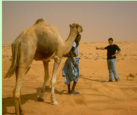
Camel hitchhiking in the Sahara desert