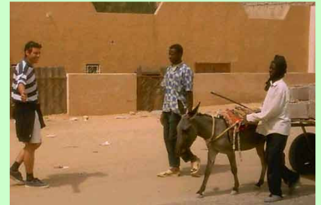
Donkey hitchhiking in Mauritania