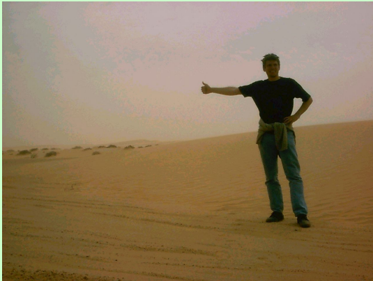
Crossing the Sahara desert