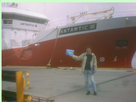
Reaching Antarctica hitchhiking an ice-breaker